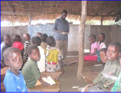
Children in a community school in Kazembe