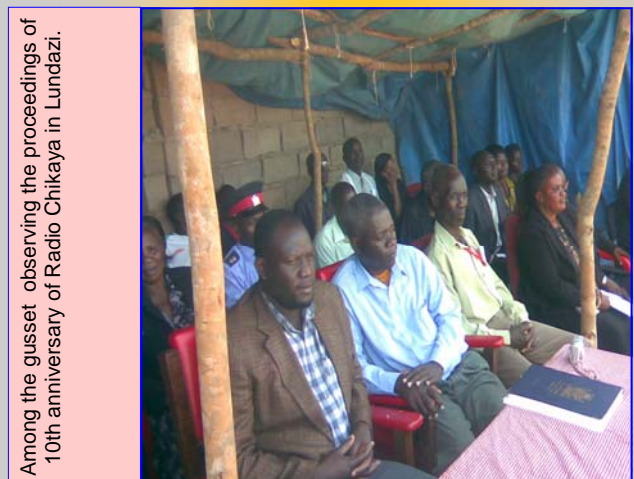
Among the guesst observing the proceedings of 10th anniversary of Radio Chikaya in Lundazi.