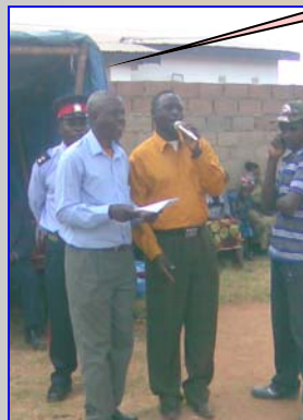
DC at 10th Anniversary of Radio Chikaya in Lundazi

The District Commissioner further said he was aware of numerous challenges the radio station is currently facing in its day to day operational affairs like technical, accommodation, transport, skilled man power. The DC made an earnest appeal to all stake holders and well wishers to help and support the growth of the radio station.