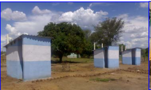
The VIP toilets constructed by RFDP under Water and Sanitation Program.