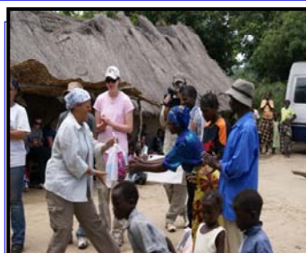
Anir Executive Director presenting school requisites to teachers and pupils of Nundwe Community School.

Other success includes, constructing and handed over 40 VIP