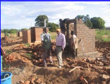
The Head Teacher of Kazembe Basic School and Programs Coordinator posing for the photo next to the VIP Toilets under construction.