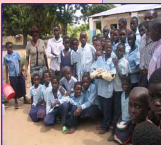
RFDP Staff with beneficiaries at Kazembe School.