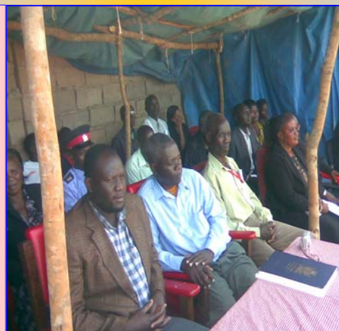
Among the gusset observing the proceedings of 10th anniversary of Radio Chikaya in Lundazi.