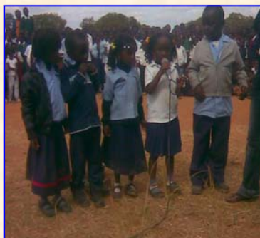
Children reciting poems during the Day of African Child.

This year's event was colorful and different because pupils who took part in the debate earlier in the week were awarded certificates in their recognition for their outstanding performance. In attendance was Lundazi District Commissioner who was the guest of Honour at this year's event, Government heads of departments, Teachers, NGO's, Churches leaders, Media Personnel, parents, children in school and children out of school.