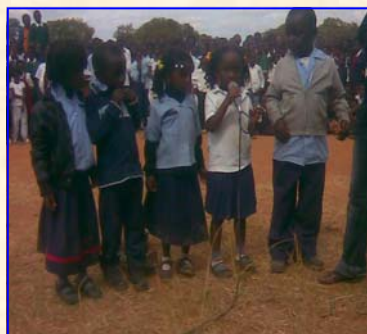
Children reciting poems during the Day of African Child.

This year's event was colorful and different because pupils who took part in the debate earlier in the week were awarded certificates in their recognition for their outstanding performance. In attendance was Lundazi District Commissioner who was the guest of Honour at this year's event, Government heads of departments, Teachers, NGO's, Churches leaders, Media Personnel, parents, children in school and children out of school.