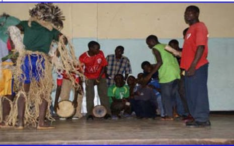
Pupils of Lundazi Boarding High Secondary School performing during the Anir volunteer visit.