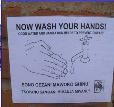
A poster stuck on one of the toilets constructed by RFDP advising people to always wash hands after using the toilet.

Did you know that, Child's rights are Human Rights. So promote United Nations Convention on the Rights of a Child (UNCRC) NOW.