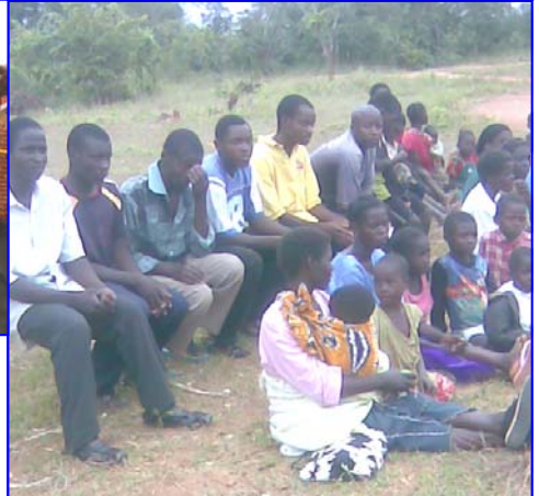
Community members listening to RFDP staff during a meeting for Livelihood and enterprises in Kopenja.