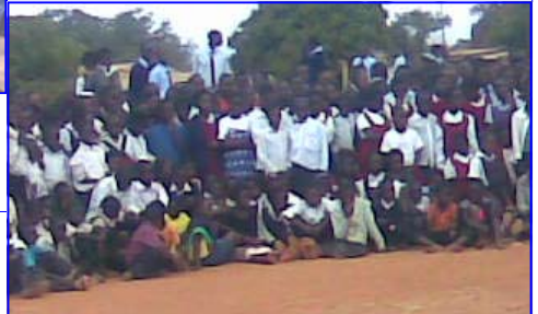
School children participating during the Day of African Child at Lundazi Show grounds on 16th June, 2010.