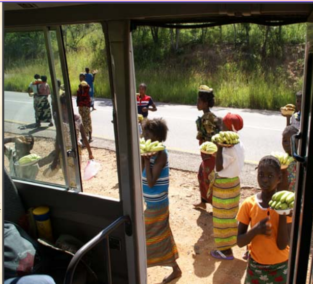
Women and Children selling farm Produce to the traveling public to make ends meet.

Lavished with HIV/AIDS, elderly people have been left with the burden of looking after grand children with no source of income, no food to provide for the young ones as they have no power to work or do any thing by themselves. Women also are hard hit because of heavy work load they are supposed to carry. RFDP is restoring hope by working with the rural communities, addressing the challenges they face in rural areas.