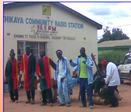
ZASP local musical band entertaining the audience during the 10 th Anniversary of Radio Chikaya in Lundazi.

He thanked the honourable chiefs for their generosity towards the construction of the building which currently is underway. Whilst broadcasting to the Lundazi community for the past 10 years, the community radio has had a number of challenges which include lack of transport, lack of up date equipment on the on air studio despite covering a wider area and lack of accommodation among them.