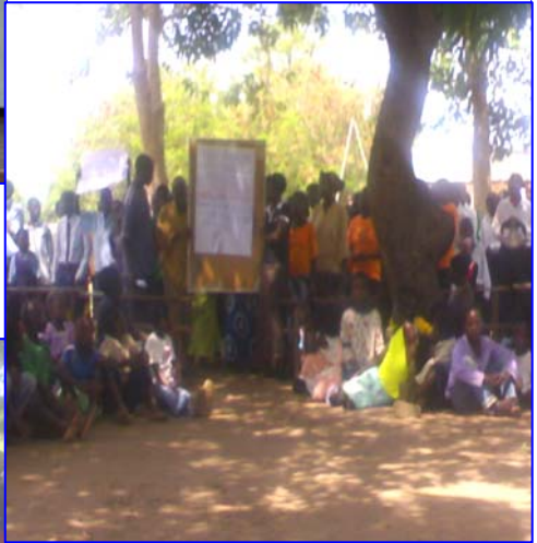
Community members participating during 2009 World AIDS Day at Kazembe Basic School