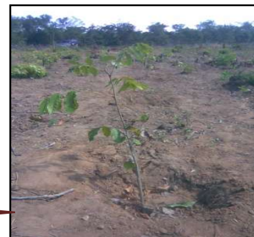
A tree planted at Nudwe woodlot.

Having distributed the seedlings, they were later transplanted in different places. In the case of Nundwe and Leopard groups, trees were transplanted into the field while were transplanted at Nundwe Community School. For Tikhazgikiske and Tilele groups all the seedlings were transplanted into the field, where as Tikondane planted its own trees in home back yards. Of the 1500 seedlings distributed 2,381 have survived and are doing fine.