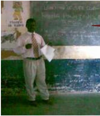
Romase Head teacher addressing the pupils And staff welcoming them at Romase just before the launch.