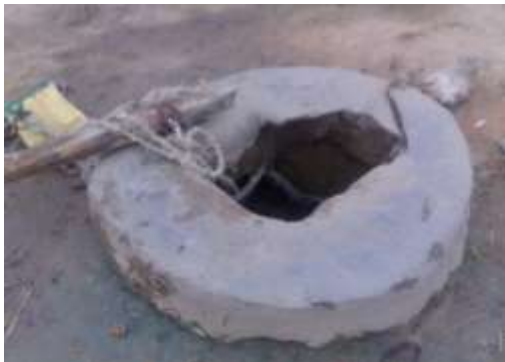
Un protected well identified by RFDP

Against all odds and the various challenges that the organisation encounter RFDP has managed to expand its programs to other areas. In addressing water and sanitation crises in most rural communities of Lundazi. RFDP has embarked on serious rehabilitation of wells, construction of pit latrines in various schools, installation of hand washing facilities and awareness campaigns on hygiene with our established water and sanitation committees.