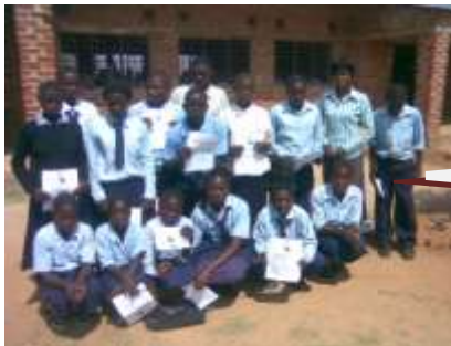
Chiwe pupils with their matron and RFDP Program Facilitator after the launch.

The Launch was conducted at Lusuntha Day Secondary, Chiwe Basic and Romase Basic schools. The SAFE clubs consisted of 15 members from each respective school and a total of 45 members from the three schools. However, apart from launching the SAFE clubs, the community workshop was conducted and not only to SAFE club members but also to other community youth members. The role of these clubs was to increase the understanding and have knowledge of HIV/AIDS and other social vices and the impact on the youths through Behaviour Change Communication (BCC).