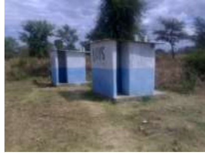
Some of the pit latrines built at Chitungulu Middle School.

RFDP also constructed 12 double ventilated improved toilets in 6 schools (government and community schools) funded by Netherlands Albert Schweitzer Foundation (NASF). These toilets have been constructed from underneath so that they do not collapse in case of heavy rains during the rain season.